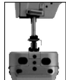
Unison feed assures even feed when sewing multiple layers

* Depends on thread, material & type of operation