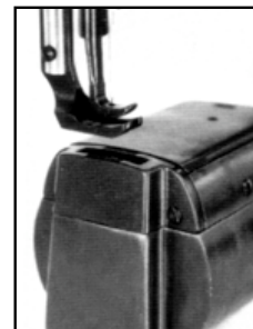
Unison feed assures even feed when sewing multiple layers