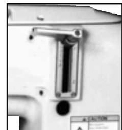
Reverse stitching with lockable stitch length regulator