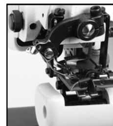
Swing down cylinder arm

* Depends on thread, material & type of operation