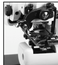
Swing down cylinder arm

* Depends on thread, material & type of operation