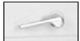
The presser foot lift bar is located in the front of the casting for easy access