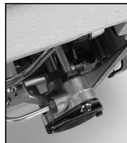
Built-in oil pump