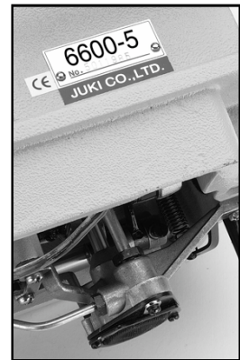
Built-in oil pump