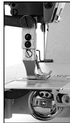
Alternating presser feet may be easily adjusted