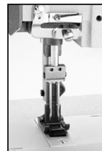
Unison feed assures even feed when sewing multiple layers