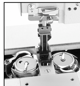
Large self-lubricating rotary hooks

* Specifications subject to change without notice