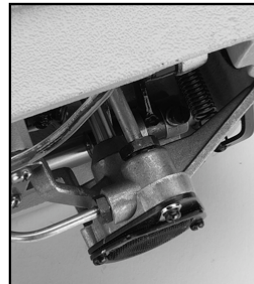
Built-in oil pump