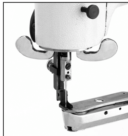
Presser foot rotates 360°

* Specifications subject to change without notice