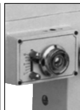
Zig-zag width may be easily adjusted