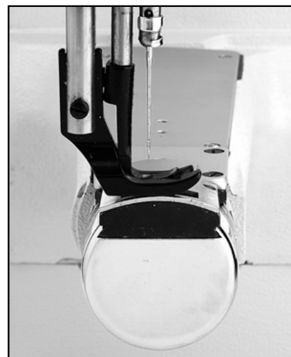
Unison feed prevents slippage between layers

* Depends on thread, material & type of operation