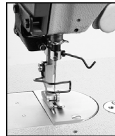
Thread wiper system