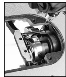
Automatic thread trimming system

* Depends on thread, material & type of operation